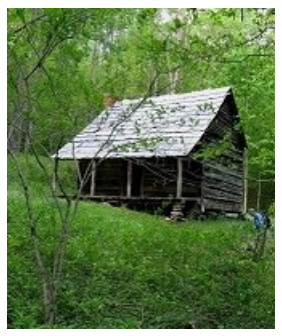
Hannah Cabin on Little Cataloochee trail